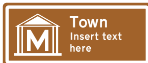
Museum or Art Gallery