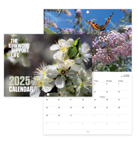
Landscape A5 CALLS01 148x210mm (opening to 210x296mm)