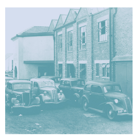
Everything you see in this brochure is manufactured in our iconic factory situated just off the seafront in (usually) sunny Hastings.

We value our team's ability to work together, from our designers creating the original artwork to Tash assembling your products and despatching them out the door. We like to feel that we can iron out any queries quickly and we get the best possible results from our creativity and manufacturing skills.