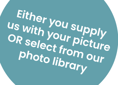
Step 1 Supply your own picture or select from the Alamy Library

*For the use of Alamy pictures there is a one off cost per picture per product. Please speak to our sales team for more information.