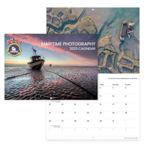
Landscape A4 CALLS03 297x210mm (opening to 297x420mm)