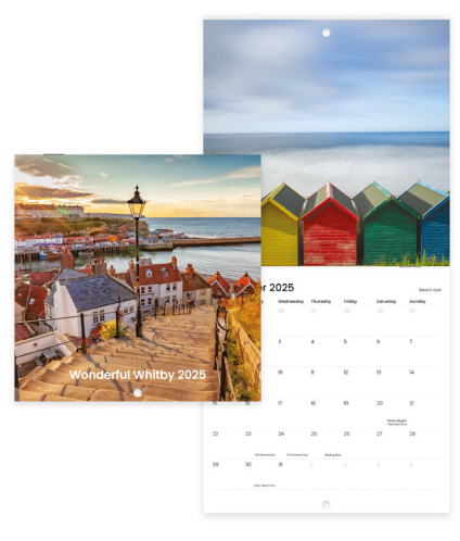
Square midi stapled CALSQ02D 206x206mm (opening to 206x412mm)

Landscape maxi CALLS02 290x206mm (opening to 290x412mm)