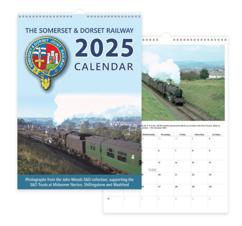
Portrait maxi CALPT01 206x290mm